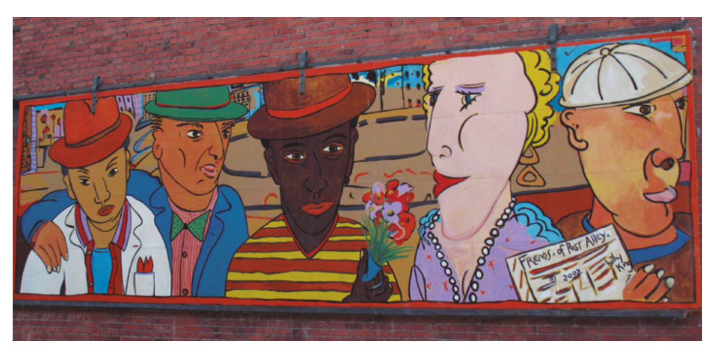
Mural in Seattle.

focus on personal development through culture or physical education, as at the Happy Learning Centre in Paju (Republic of Korea) and in the adult education programmes run in Okayama <sup>18</sup> (Japan) and in Tunis (Tunisia). Following a similar line of action, Quebec (Canada) offers university courses for the elderly, which include a wide variety of disciplines and activities, while Shenzhen <sup>19</sup> (China) has developed a learning website that integrates numerous educational resources and offers more than 100 free courses on a wide range of topics.