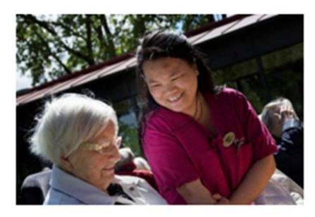
3,900 people receive care at retirement homes