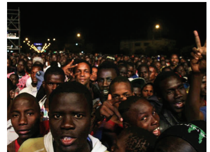
Youth enjoying night concerts

The young people see that they can make their passion into their profession, and can live off their art, which they thought of only as a hobby. To date around 500 young people have benefitted from the training provided by the MCU.