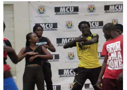
Creativity and training in the MCU