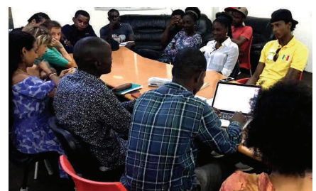
Diverse activities offered by the House of Urban Cultures.

The MCU strives to become a benchmark for urban cultures, and at this time is the only one in