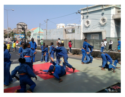
Judo initiation class

In order for the citizenry to use these facilities as their own, they are managed by neighbourhood committees, whose members are in local development associations and chosen by the community. One of the criteria is that the