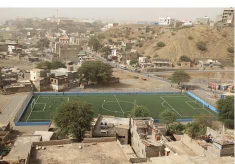
New football field

the sport facilities consisting of neighbourhood committee made up of residents, and with close collaboration with the City Council of Praia.