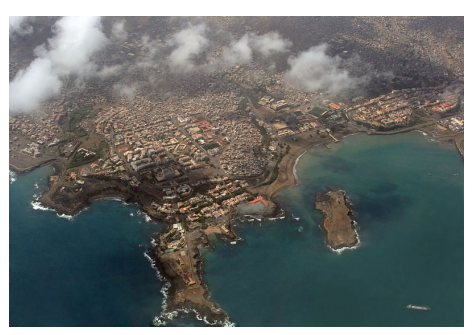
Aerial view of Praia - Photo: David Trainer

Praia is located in the south of the Island of Santiago and is the capital of the archipelago of Cape Verde. It has around 140,000 inhabitants, which is 27% of the population of Cape Verde (2007 data). 47.8% of the population is male and 52.2% female and more than half are young people under 25 years old. Families in which the women are the bread earner make up 43.6% of the total.