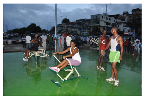
Fitness park facility

entire committee must have a woman in charge of encouraging and stimulating women's sport, as well as one member of the City Council, to ensure good relations between the local government and civil society.