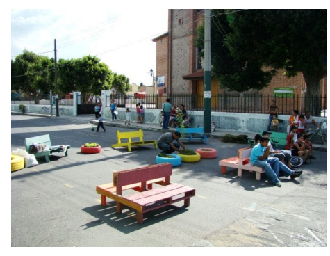
A new use of the street