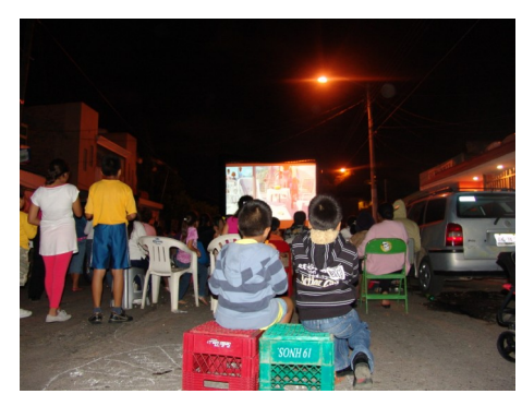
Open air cinema by night