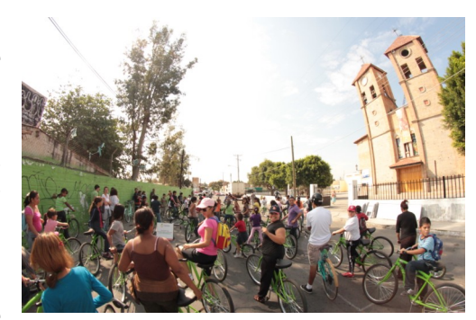
Knowing the city by bike

In order to recuperate our public spaces and decrease crime rates and violence in the city through citizen participation, the Municipal Government of Zapopan set up in April 2011 a programme called "United