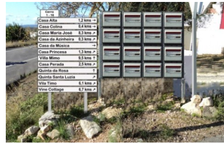
Standardization of signage