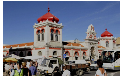
Loulé Market