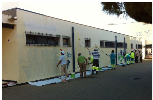
Volunteers Painting public buildings