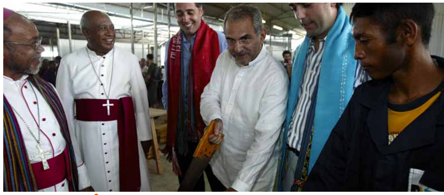
Authorities and workers at the Baucau plant