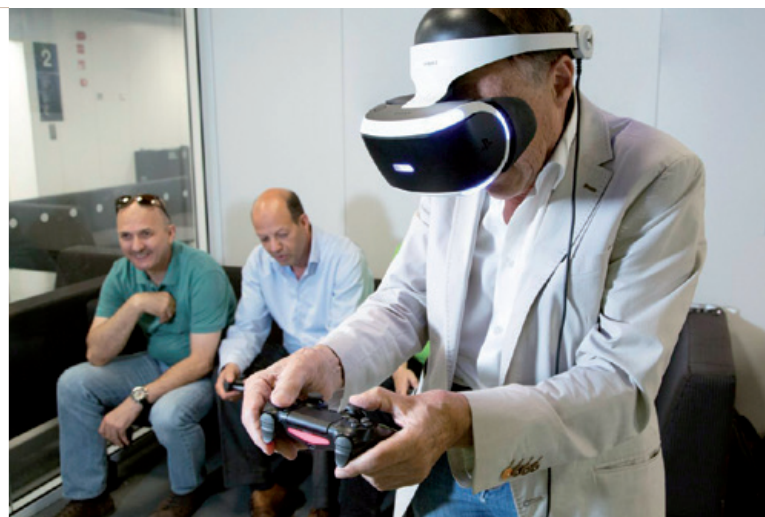
The Oodi library has videogames and multimedia rooms available

Oodi library is a leading example of the updated role of public libraries in Helsinki. According to reactions from numerous international guests, the concept would be relevant in their circumstances as well. Oodi seems to be an suitable answer to many new and longstanding needs of today's citizens. 1