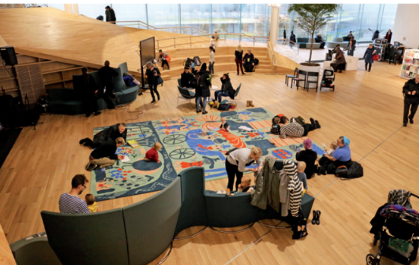
In the Helsinki city centre, there was a particular lack of spaces for family use. Since opening the new Oodi Central Library in December 2018, families are one of the most eager user groups.