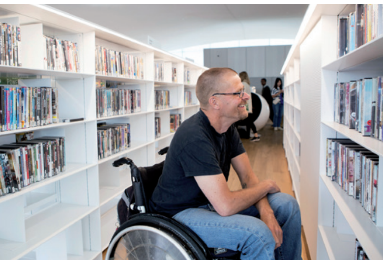
Libraries in Helsinki are accessible to all