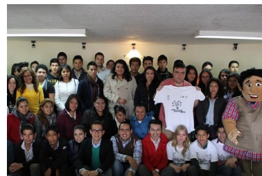
Closing ceremony of the programme