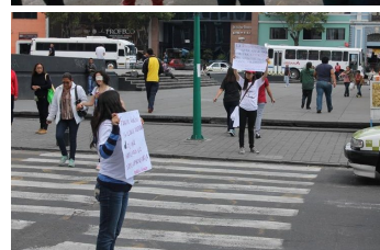
Youth people participating in social awareness campaigns