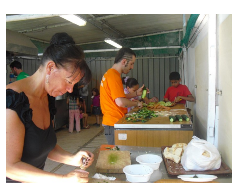
Preparing the community dinner

The purpose of this initiative is to develop a greater sense of community feeling in the neighbourhood and bring locals and immigrants, youth and adults, closer together. This idea arose from the wish of children to jointly organize a dinner with people in the neighbourhood. The first dinner took place in 2011 and was held in a small garden where kids normally play. The dinner was prepared jointly by the entire neighbourhood, including children, educators, tradespeople and volunteer associations.