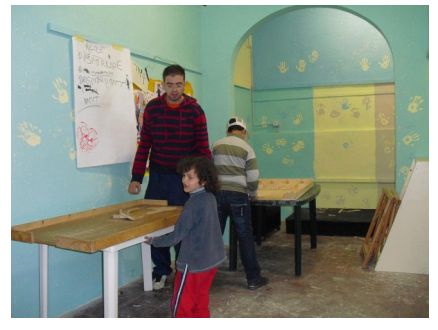
Refurbishing the recreation space

This is a premises of the City Council assigned to the residents of the Castello Alto district, refurbished with the help of the residents in the neighbourhood, including children. It is made up of three different spaces, in which different activities are carried out, that change based on the suggestions of children and youth. Educators and volunteers help out with the activities. Families and educators also meet here, which helps everyone to get to know each other.