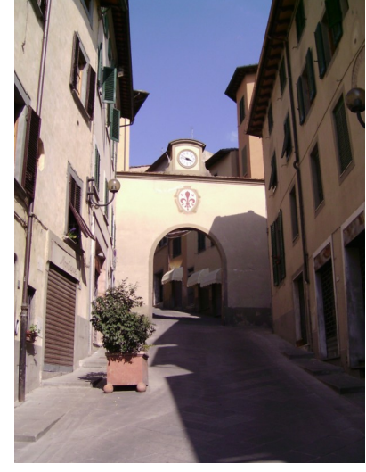
Arch of Entry to the Castello Alto Neighbourhood

The Kappaerre Association, a social welfare body fostering citizen participation, has taken charge of creating and rolling out the project, as well as coordinating the local associations involved and the informal groups of citizens who also participate in the project.