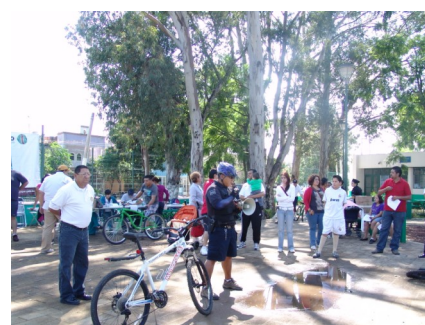
Citizens participating in project activities