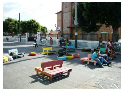
A new use of the street

e) “Free Parks”: travelling theme parks. Abandoned municipal spaces are located in order to transform them with the support and collaboration of the residents, turning them into spaces designed by the same residents. The activities are designed for each block: for example: on one block activities are carried out for children that foster and recoup Mexican traditions: traditional games, such as hopscotch, raffles, etc., while in another street, activities are carried out for adults: dancing, crafts, exchange of professions, etc.; and in another street there are activities for young people: sports tournaments, urban art, or graffiti competitions, music band competitions, etc.