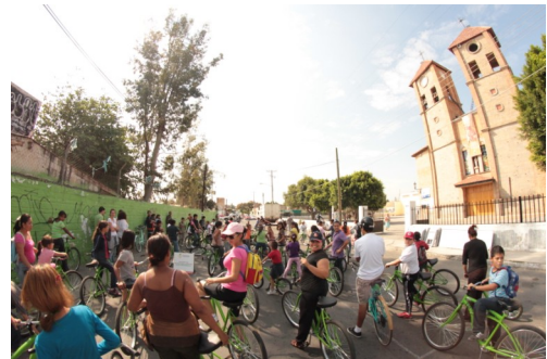
Knowing the city by bike