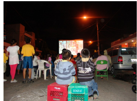
Open air cinema by night

b) “Open Air Cinema”: showing films on a gigantic screen in public spaces of the participating neighbourhoods. In order to generate a cross-generational encounter, the films selected are addressed to all audiences and transmit family values.