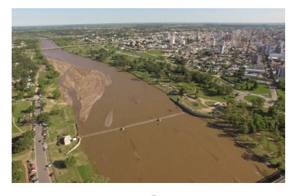
View of Río Cuarto

It is a dynamic agricultural-livestock raising region. With more than 150,000 inhabitants, it is the second most populated city in the province of Córdoba. It is an important commercial and services hub for the central region of Argentina.