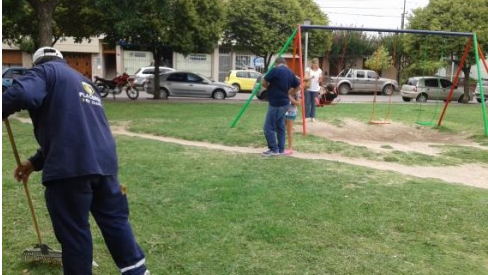
Civic values at parks and squares of Río Cuarto

In order to overcome this situation, the City Council of Río Cuarto decided to reverse this urban dynamic and to propose actions that could make people value public spaces as meeting places of inclusion where residents can experience coexistence, tolerance, and joint the construction of a collective spirit.