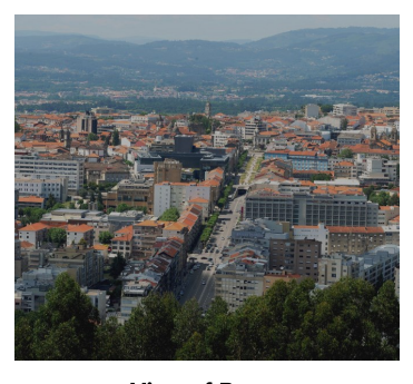
View of Braga