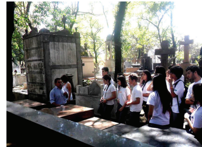
School tours to the cemetery

In March 2015, the "Extended Classrooms" were created at the Consolação Cemetery for teacher training, as a result of the joint effort of the Funeral Services and the Education Department of the Ipiranga District, to promote cemeteries as inter-disciplinary spaces to foster knowledge in which art, history, culture, environment, etc., intervene. Due to the success of this activity, many schools requested tours to the cemetery, and that is why it was decided to make Wednesdays the visiting day for the schools.