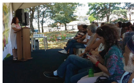
Varied agenda of activities at the cemeteries