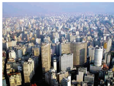
View of São Paulo

In São Paulo there are 73,000 burials and 11,000 cremations each year. This represents 220 funerals and 30 cremations per day. The Project Memory & Life takes place at 22 public cemeteries in São Paulo spread out across the city.