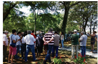
Environmental tours at cemeteries

In August 2015 the Vila Formosa "Self-Guided Environmental Tour" was started in order to foster knowledge amongst the population of the diverse fauna and flora at the cemetery, through educational, cultural and recreational activities.