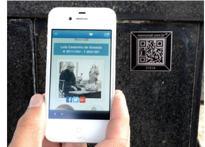
QR codes fitted onto tombs

In January 2015, 150 QR codes were fitted onto major historical-artistic tombs at the Consolação Cemetery. Through this tool, visitors are provided with photos, videos and writings about the life of the famous people buried at this cemetery, in order to strengthen its museum-like character. A self-guiding tour was also created for visitors to acquire knowledge of these prominent personalities, as well as the artistic works that adorn their tombs. Other cemeteries have also installed QR codes in their routes.